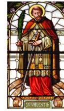
Celebrating Saint Valentine

The Diocesan Child Safeguarding Policy is published on all notice boards in the Church and the Parish Centre, and copies of the document are available to read in the Parish Office and the Parish Centre. For further information please see www.csps.dublindiocese.ie